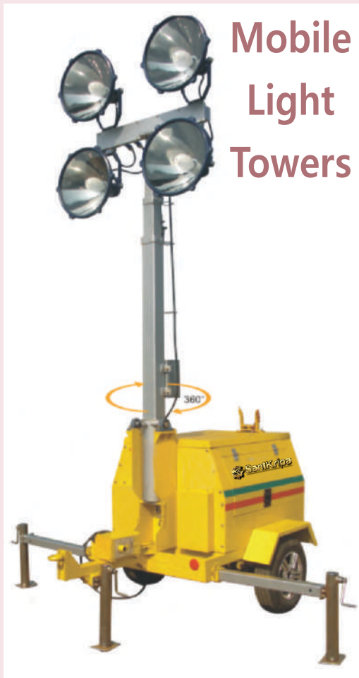
Mobile Light Towers