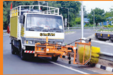
CRASH BARRIER MAINTENANCE