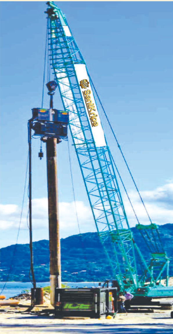
← VIBRATORY HAMMERS