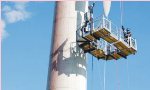
WORKING ON WIND MILL