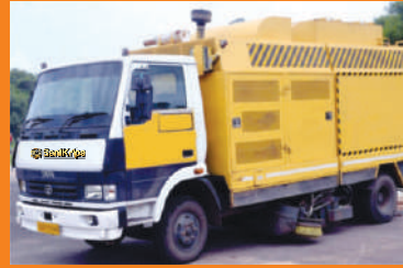
O & M SERVICES