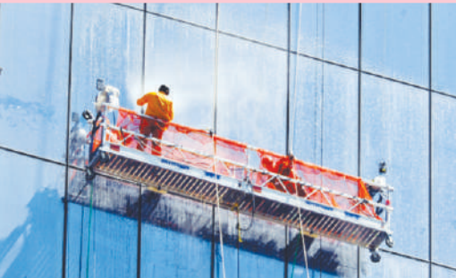
BUILDING FACADES CLEANING