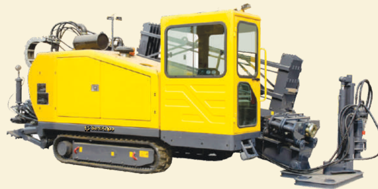
HORIZONTAL DIRECTIONAL DRILLING