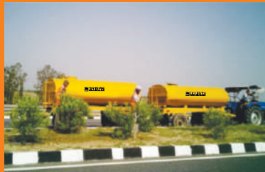
VEGETATION MANAGEMENT (MEDIAN)