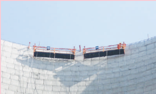
REPAIRING & MAINTENANCE OF CEMENT SILO PLANTS