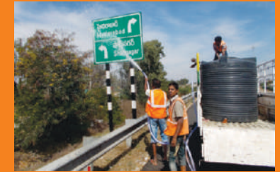
MAINTENANCE OF SIGNAGES