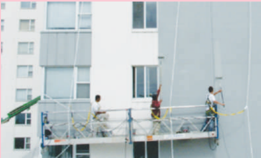
BUILDING PAINTING WORK