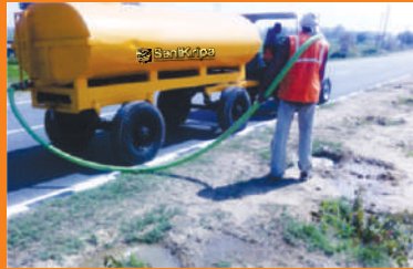
VEGETATION MANAGEMENT (AVENUE)